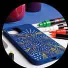
SILICONE STYLE PLASTIC