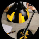
ROUGH OR POROUS METALS