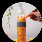
PVC STYLE PLASTIC